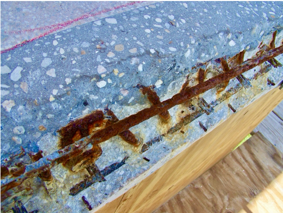
Photo: Old patching material is clearly visible, exposing advanced corrosion of embedded steel.

The persistent deterioration of previously repaired post-tensioned concrete, particularly around tendon anchors, is a developing phenomenon that some in the post-tensioning and structural repair communities have not yet fully recognized. The underlying cause of failure of these prior repairs can often be attributed to the use of incorrect repair demolition geometry that leads to the development of a highly active corrosion cell, which results in accelerated corrosion of the embedded mild steel reinforcement and the post-tensioning. This is an important issue because the potential loss of post-tensioning can compromise the integrity of a structure.