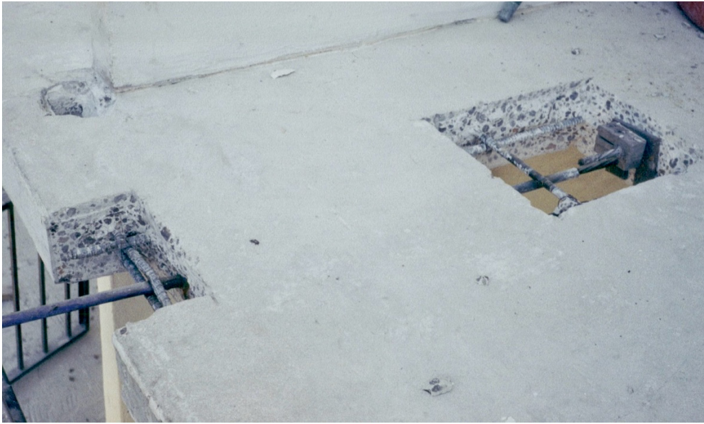
Photo: Shown is a fully excavated slab edge per ICRI requirements with tendon lock-off installed.