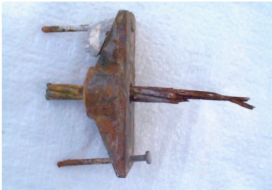
Photo: Tendon end that shows cable corrosion due to water intrusion into the cable sheathing.

Ongoing corrosion of embedded mild steel around the post-tension anchorages will result in cracking and spalling of the concrete coverage in this critical area. These cracks will permit water to penetrate deeply into the slab and down to the level of the post-tensioning, which can find its way directly into the cables through any disruptions in the tendon sheathing. When this is allowed to happen, it substantially increases the likelihood of corrosion of the steel cable and can ultimately result in a failure of the tendon.