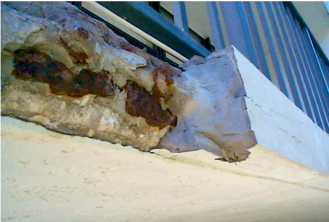
Photo: This failed slab edge patch was applied to the surface of the anchors without fully excavating the damaged area.

When corrosion damaged concrete is removed only from the face of the anchors and surrounding rebar, this causes the embedded steel elements to become sandwiched between the existing concrete that remains and the new concrete patching mortar. The resulting extreme differential between the properties of the two concrete materials creates a macroscopic corrosion cell with increased corrosion potential that causes the embedded steel to continue to corrode at a rapid rate. The International Concrete Repair Institute (ICRI) describes this phenomenon as the Anodic Ring or Halo Effect. They attribute this accelerated corrosion to the differential in electrical potential that's created "between the chloride contaminated or low pH existing concrete and the chloride-free or high pH repair material".